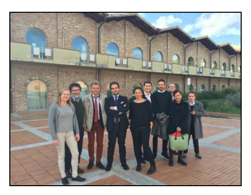
DIST kick off meeting - Empoli (Italy)

DIST partners have been participated in the kick off meeting in the ASEV premises (Empoli, IT) to deepen the features of the project and to agree on the future steps to be undertaken.